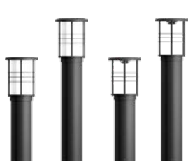
Forrey 6 Ø6.3