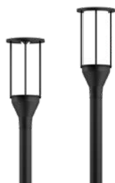
Forrey 15 Ø12.5"