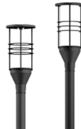
Forrey 16 Ø12.5"