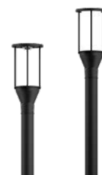
Forrey 13 Ø12.5"