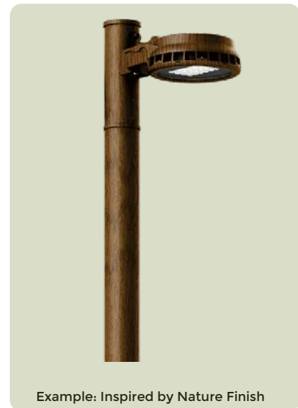
Example: Inspired by Nature Finish