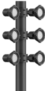
Mic 3 Cluster