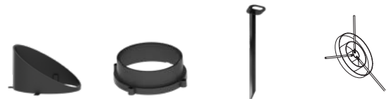
A50231 Anti Glare Visor