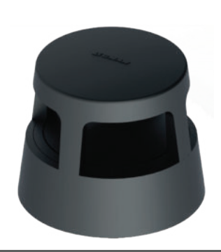
30w COB 1605 Lumens