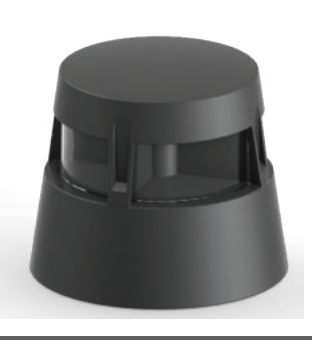
8w COB 269 Lumens IP67 • Suitable For Wet Locations IK08 • Impact Resistant (Vandal Resistant) Weight 12.7 lbs