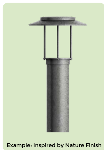
Example: Inspired by Nature Finish