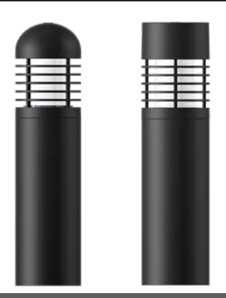
41w COB 390 Lumens IP65 • Suitable For Wet Locations IK08 • Impact Resistant (Vandal Resistant) Weight 30 lbs