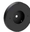
SCDD Surface Conduit Decorative Trim