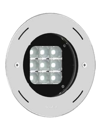
21w LED - 2319 Lumens IP68• Suitable For Wet Locations IK07• Impact Resistant (Vandal Resistant) Weight 5 lbs