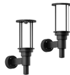
Forrey 21 Ø9.8"