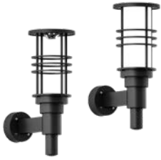
Forrey 22 Ø6.3