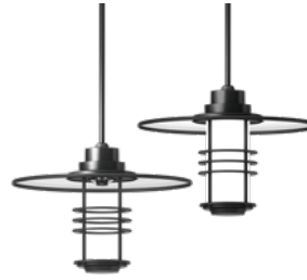
Forrey 28 Ø34.6"