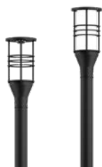
Forrey 14 Ø9.8"