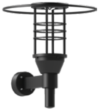
Forrey 34 Ø20"