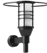
Forrey 36 Ø20"