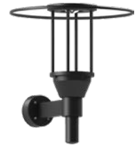
Forrey 33 Ø20"