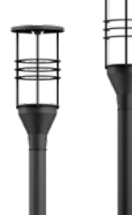
Forrey 16 Ø12.5"