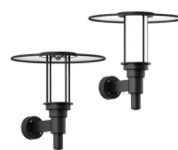
Forrey 17 Ø26"