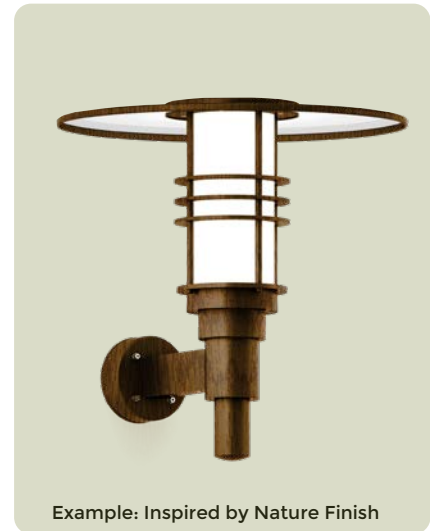
Example: Inspired by Nature Finish