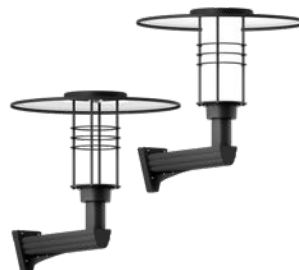
Forrey 20 Ø34.6"