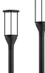
Forrey 15 Ø12.5"