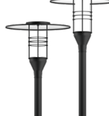
Forrey 12 Ø34.6"