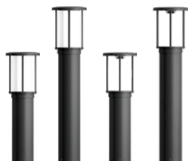
Forrey 5 Ø6.3