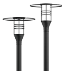
Forrey 10 Ø26"