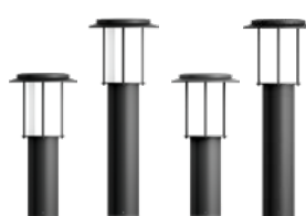
Forrey 3 Ø7.3"