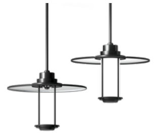
Forrey 25 Ø26"