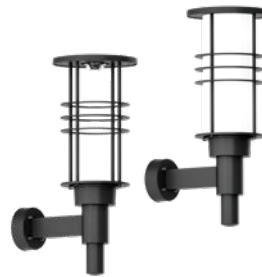
Forrey 24 Ø12.5"