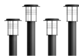
Forrey 4 Ø7.3"