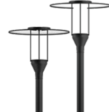
Forrey 9 Ø26"