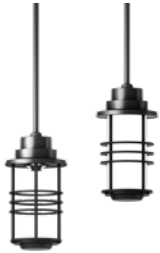
Forrey 30 Ø9.8"/8.8"