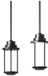
Forrey 31 Ø12.5"/10.5"