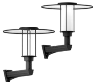
Forrey 19 Ø34.6"