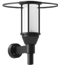
Forrey 35 Ø20"