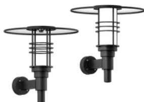
Forrey 18 Ø26"