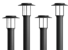
Forrey 1 Ø6.3