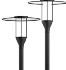
Forrey 11 Ø34.6"