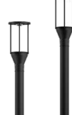
Forrey 13 Ø12.5"