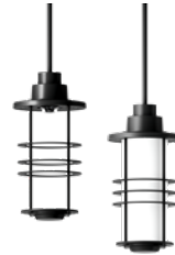
Forrey 32 Ø12.5"/10.5"