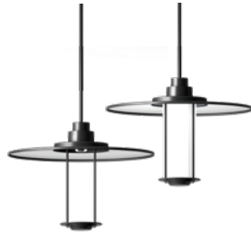
Forrey 27 Ø34.6"