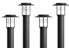
Forrey 2 Ø6.3"