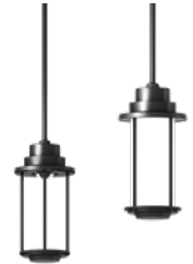
Forrey 29 Ø9.8"/8.8"