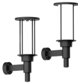
Forrey 23 Ø12.5"