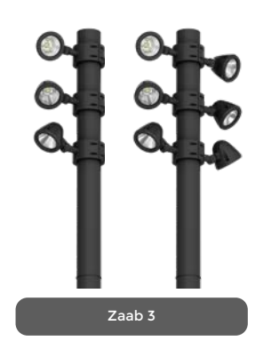
• UZA-20001-3x40w-3x4091lm • UZA-20011-6x40w-6x4091lm