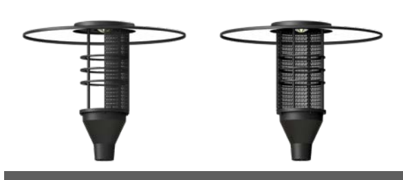
PHSS Perforated House Side Shield