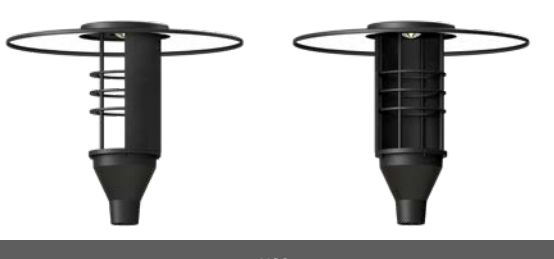
HSS House Side Shield