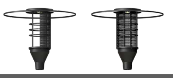
PHSS Perforated House Side Shield