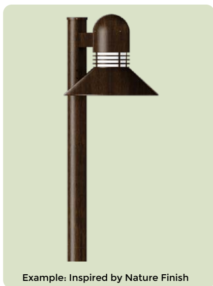
Example: Inspired by Nature Finish