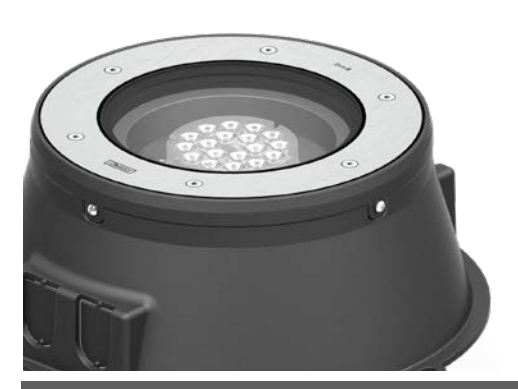
29w LED 1299 Lumens IP67 • Suitable For Wet Locations IK10 • Impact Resistant (Vandal Resistant) Weight 14.3 lbs