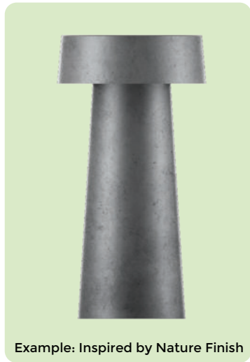
Example: Inspired by Nature Finish