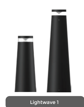
• ULW-10871-27w-475lm [22.2"] • ULW-10872-27w-475lm [34.2"]