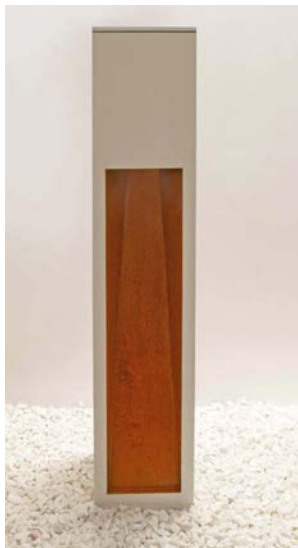
FNF Front Face Nature Finish