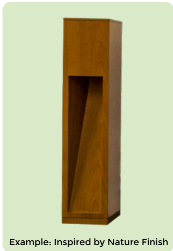
Example: Inspired by Nature Finish