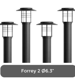
UFOR-10002-48w COB-3527lm-32.4" UFOR-10012-48w COB-3527lm-42.8" UFOR-10022-50w LED-3361lm-32.4" UFOR-10032-50w LED-3361lm-42.8"

• UFOR-30042-70w COB-6603lm • UFOR-30052-60w LED-4053lm