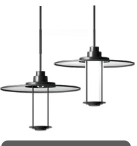
Forrey 27 Ø34.6"

• UFOR-95041-70w COB-7522lm • UFOR-95051-60w LED-4553lm