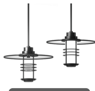
Forrey 26 Ø6.3

• UFOR-95002-48w COB-3749lm • UFOR-95012-50w LED-3275lm