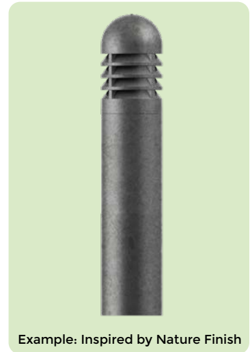
Example: Inspired by Nature Finish