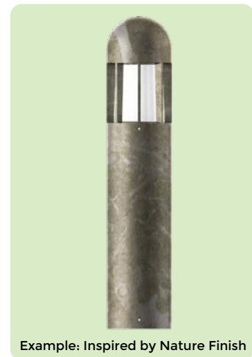
Example: Inspired by Nature Finish