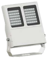
PH Painted Hardware