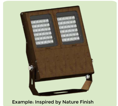
Example: Inspired by Nature Finish